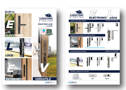
See page 17 - 19 In SGLOCKS Newsletter March / April 2025