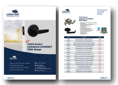
See pages 4 - 13 In SGLOCKS Newsletter March / April 2025