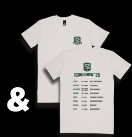
LIMITED EDITION ROADSHOW' 25 T-SHIRT