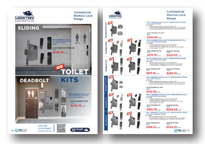
See pages 14 - 15 In SGLOCKS Newsletter March / April 2025