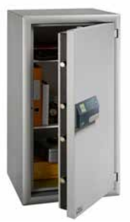
Art ID. MTD780-E-FP