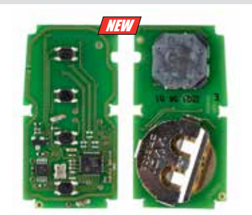
Art ID: XS-TOY-00